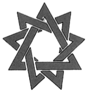
The Baha'i Faith