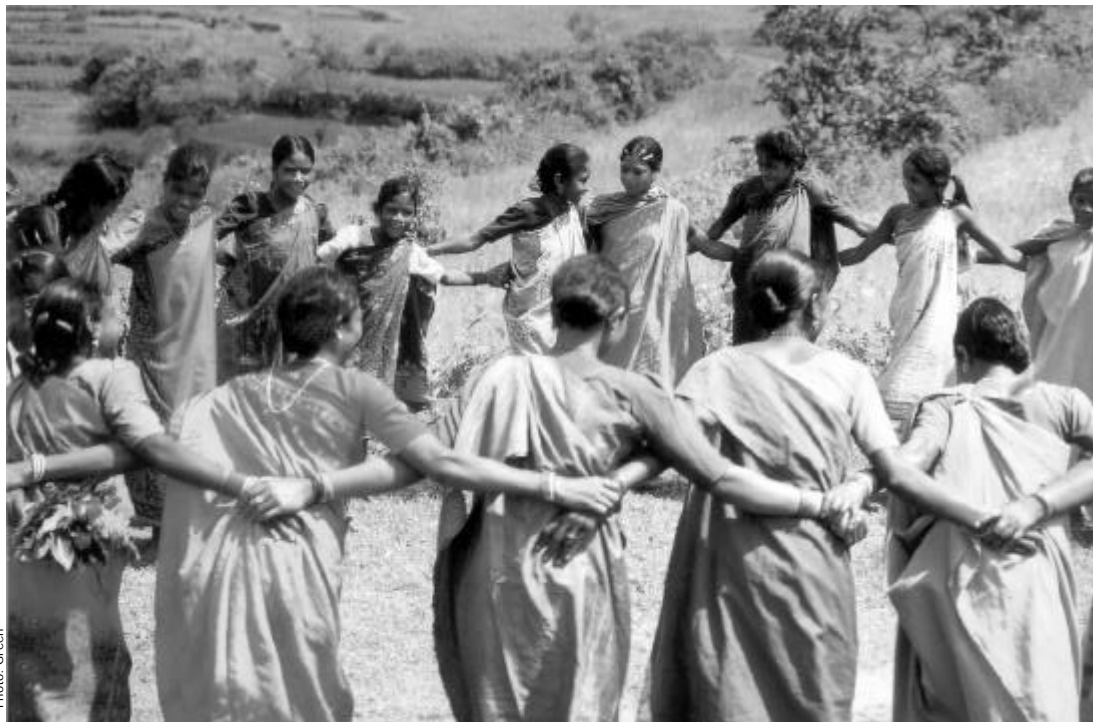
Girls dancing the traditional way

cesses grow. Efforts are being made to support the forum to work in the direction of strengthening the tribal cultural identity, while co-ordinating with modern knowledge systems and institutions.