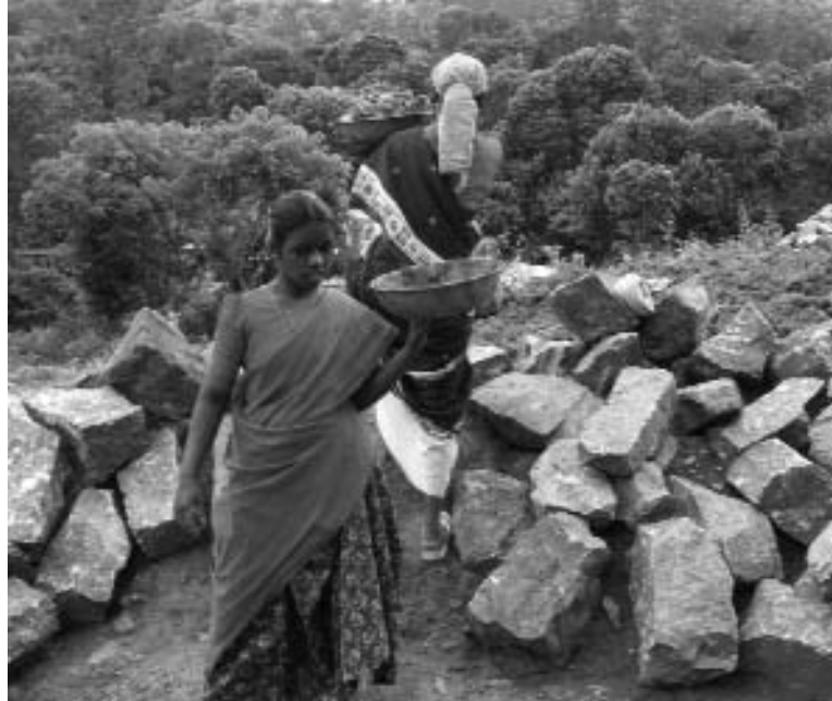
An Irula women's group in southern India building their new Village Resource Centre, initiated by Keystone. Here they will be able to improve their income through value-addition from non timber forest products.

Living in another country has made us see our own lives from another perspective, and in turn has made us question our lives, motives and purposes. For example, we now know more about the Kurumbas of the Nilgiris than the indigenous Samis in northern Sweden. Where should we put our effort? What can we actually do to make a difference? How can we truly live as we learn? Maybe the only place where we really can act effectively is at home.