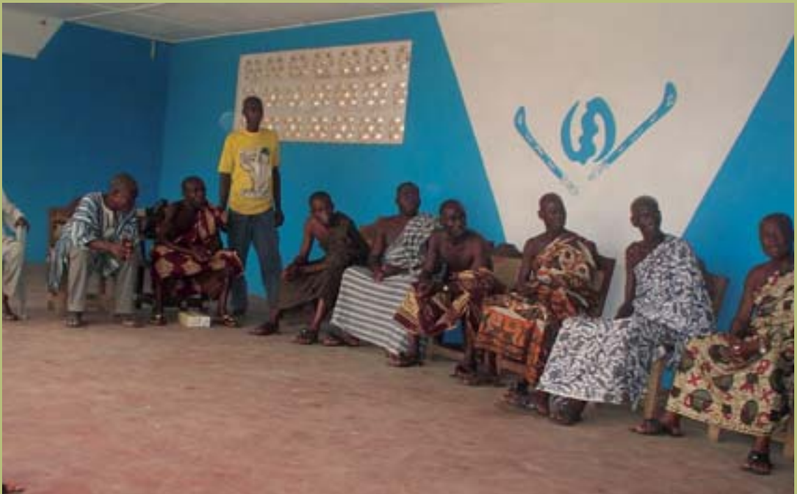
Traditional leaders during a training sessions organised by CIKOD. Traditional institutions experience interference from modernity, religion and the state. The challenges for endogenous development include (re)constructing traditional institutions, opening them up to the demands of modern times, and incorporating genuine concerns such as gender sensitivity.