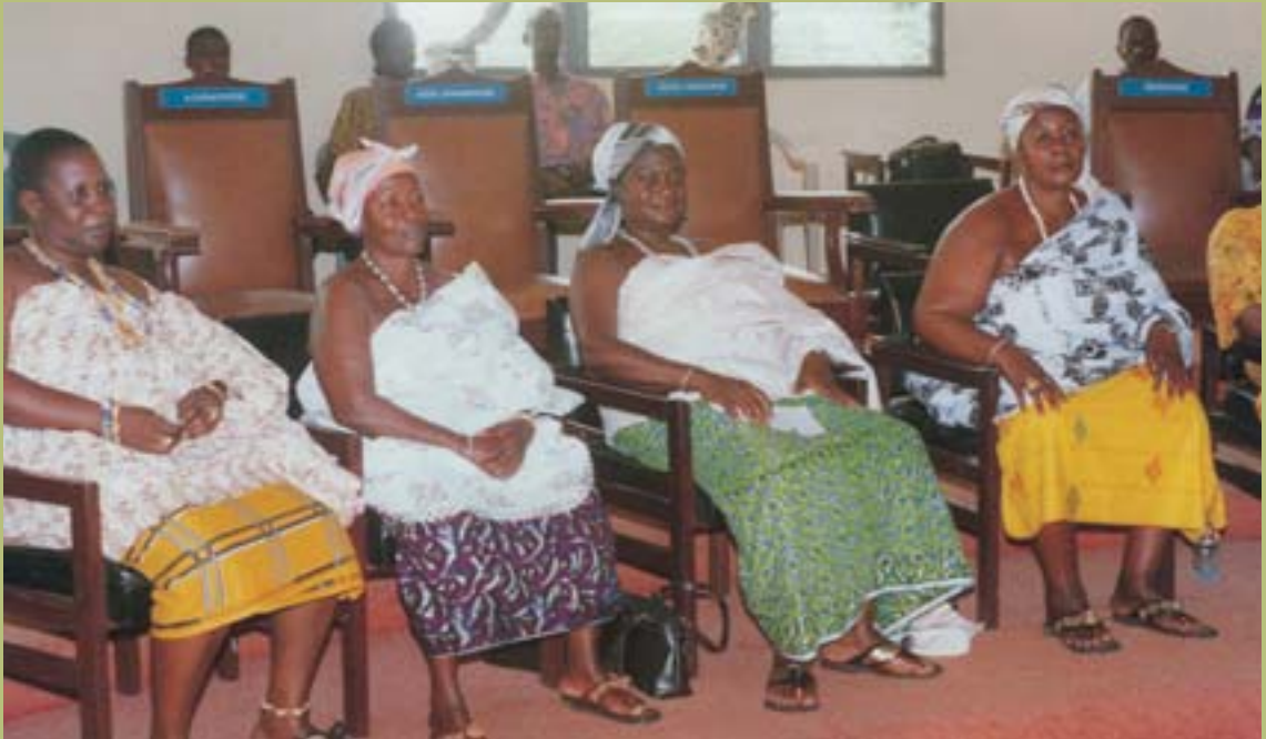
Queens from Southern Ghana at a training course organised by the Centre for Indigenous Knowledge for Organisational Development (CIKOD) and the University of Cape Coast. The subsequent lobbying of the Queens resulted in the Chieftaincy Act being reviewed in order to ensure that traditional women leaders participate fully in the processes of decentralisation and democratisation (June 2006).