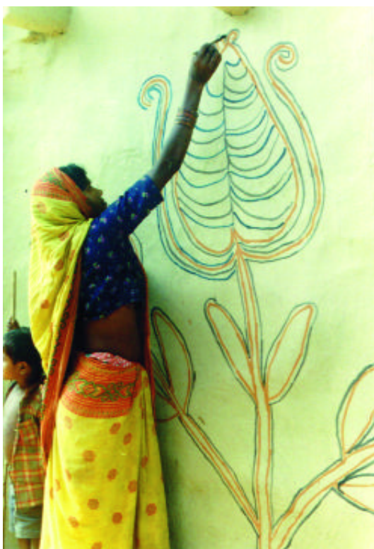
In tribal cosmologies food crops are seen as gifts from ancestors and divine beings. The Peepal leaf ( Ficus religiosa ) symbolises Mother Goddess Devi.

According to the 1991 census, around 6% of the Indian population, some 53 million people in 550 ethnic communities, have a tribal background. Many of them have maintained traditional lifestyles, knowledge and values. They believe in the existence of a wide range of divine beings and ancestral spiritual forces with benevolent and malevolent characters that inhabit houses, villages, agricultural fields, burial grounds and surrounding forests. The tribals believe that these divine beings are beyond human control and able to help or harm nature and human beings. The tribal people also believe that the good and bad ancestral spirits always watch over them and may help them in times of danger and distress. Therefore, the tribal people perform certain rites and rituals to appease the divine beings and ancestral spirits, thereby protecting themselves and getting rid of evil influences. They do not start constructing a house, distributing land, felling trees, performing a