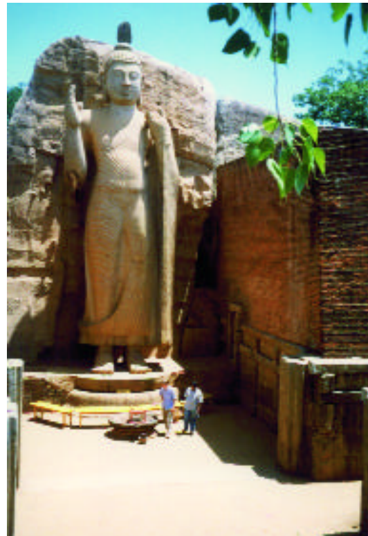
Image of Buddha in Anuradhapura, Sri Lanka.